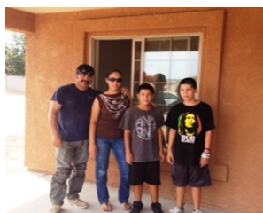
The Soto family built their new home in Somerton through USDA's Self Help Program.