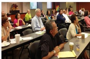
Members attend Arizona Housing Alliance Academy's 2013 Annual Seminar.